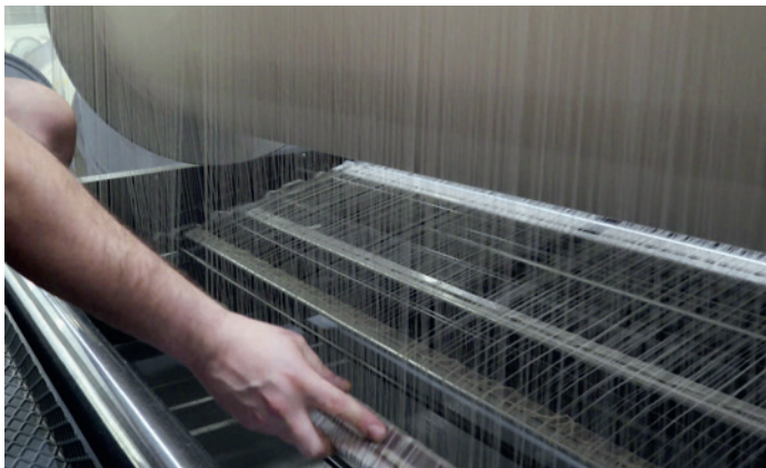
Yarn feeding system