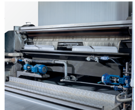
Large sizing filters easy to inspect and clean